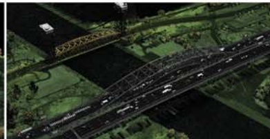
Roads or Bridges